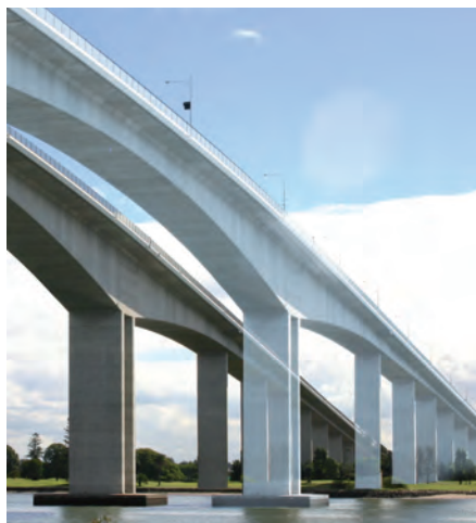
Artist's impression of the completed bridge. Image courtesy of Queensland Motorways.

Queensland's largest ever road and bridge project will rely, in part, on innovation within the stainless steel industry to meet its design life of 300 years.